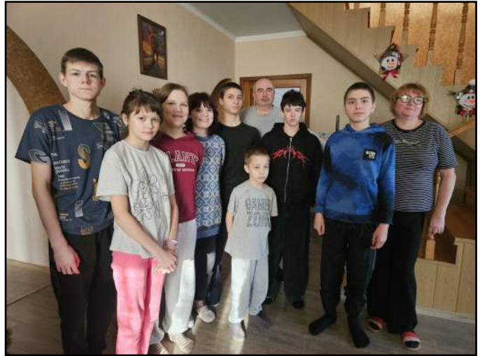
The Trembachs have 2 biological and 6 foster children.

Thus, in 2023 to escape the constant shelling and explosions, they evacuated like so many others and relocated to a village in the Cherkasy region. Mom and Dad's main goal was to keep the family together, under one roof, and provide stability. They rented a small house and enrolled the kids in their new school.