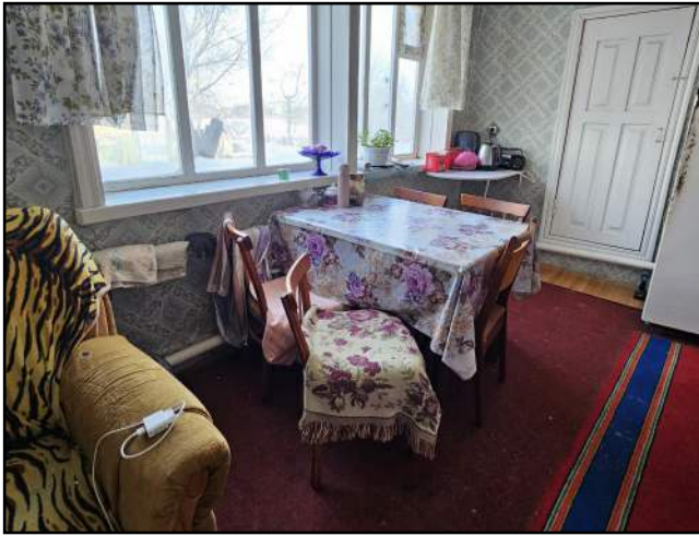
The small living room is sparse.