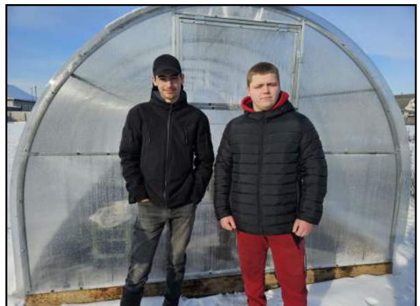
The boys standing proudly in front of the greenhouse.