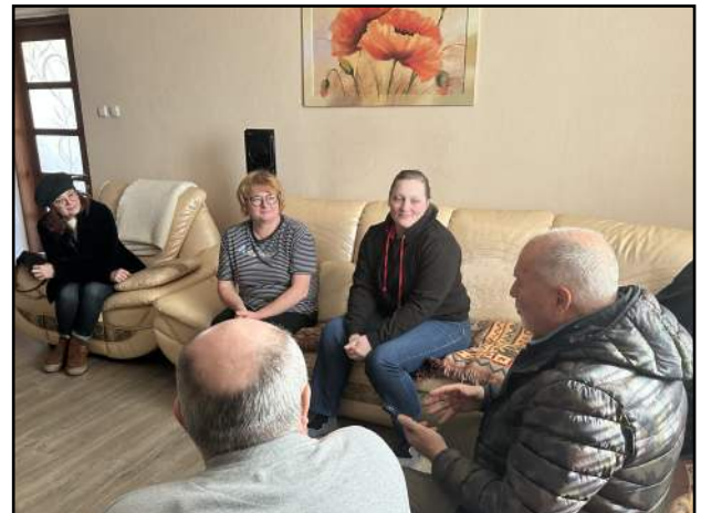
Sitting with the lights on, listening to their story.