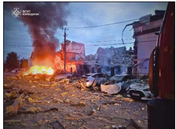
Kyiv apartments were hit early morning Sep 27th. Our staff lives with these daily explosions.