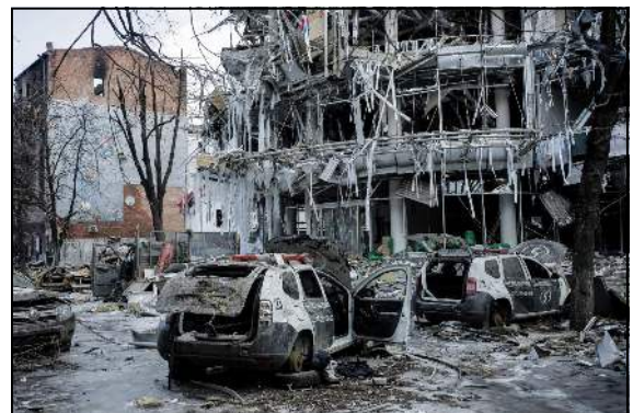
Massive strikes in Kharkiv and Kyiv took place during the talks