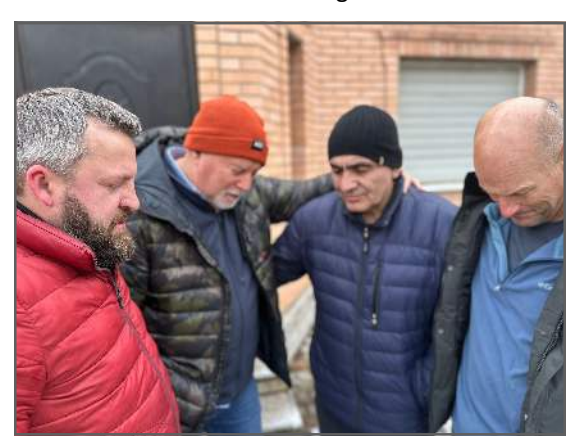
We prayed outside for protection and safety.