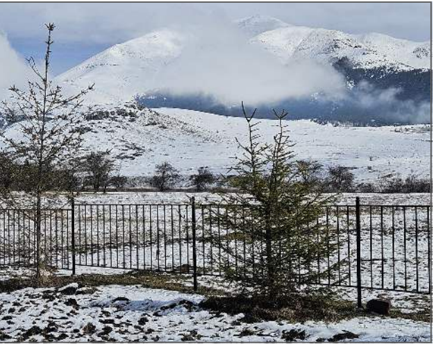
8 more acres may be available soon for additional grazing and planting. We are excited and grateful for your prayers and support.