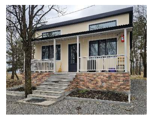
3 cabins were built with more on the way.