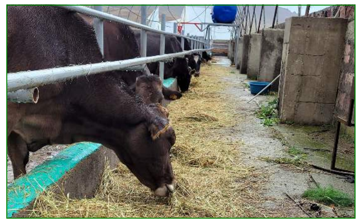
We have 5 new calves and 21 total cows. One cow died in a violent December storm and the heavy plastic cover was destroyed.

The purpose of our trip was to plan further development of the farm and to reserve our summer camp this year on the Black Sea.