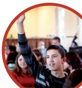
For at-risk kids

We are so encouraged to see a large portion of our ministry now lead by former orphans, foster kids, and sponsored children who had no hope until Christ’s love broke through in their lives.